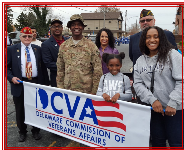
The DCVA Team are all set for the Dover Veterans Day Parade: November 2015