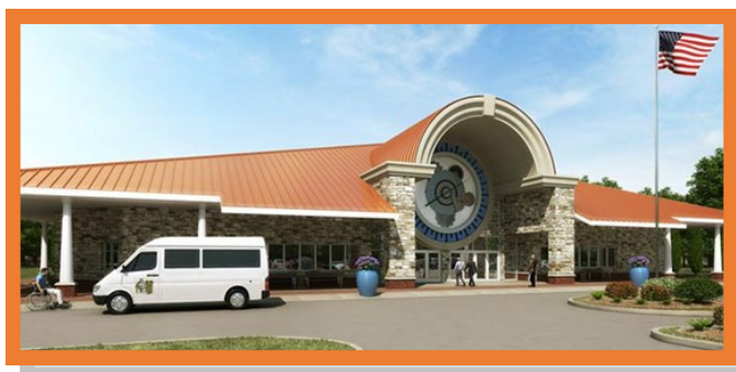
An architect's rendering shows what the VMI training center will look like when completed. It will be the only technical school in the country for US veterans.

There's a major resurgence in the popularity of mechanical watches around the world right now, and far too few watchmakers to maintain and repair them. There are an estimated 4,000 watchmaker jobs available in the US alone.