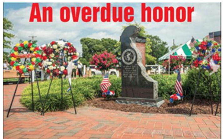
Local veterans and dignitaries gathered at the Kent County Veterans Memorial Park in Dover Sunday to dedicate the new Korean War Memorial. The monument, made of black granite, is cut in the shape of the state of Delaware.

On July 27, 1953, at 10:40 a.m., the fighting stopped in Korea after three difficult years of conflict.