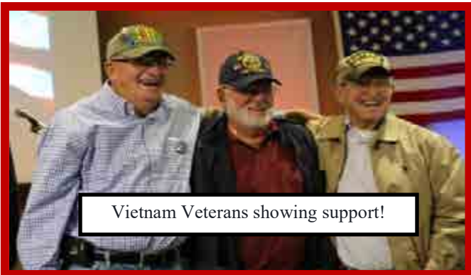
Vietnam Veterans showing support!