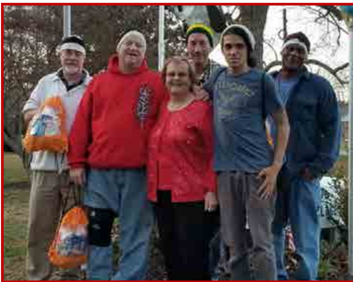
Pictured: Victory Village Back Pack recipients.