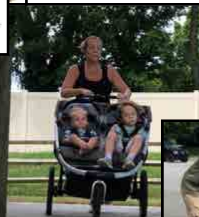
Super Mom! Courtney Stewart, Deputy Secretary of State, in the house!! She also placed 1st for female 30-39, & pushing 2 kids!!