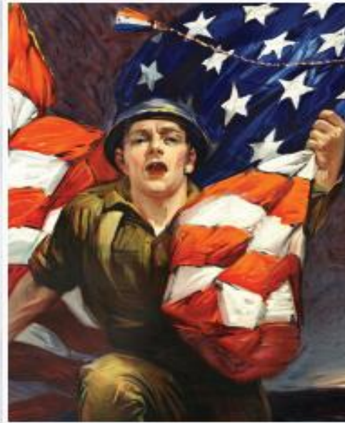
Delaware Public Archives