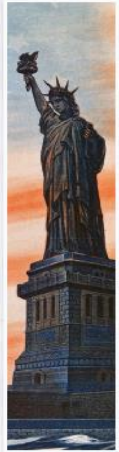
EXHIBIT NOW OPEN