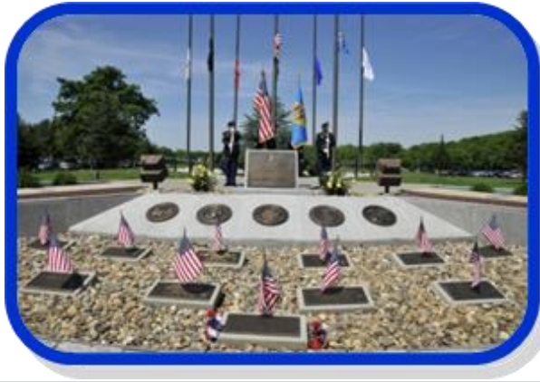
Bear Veterans Memorial Cemetery 2465 Chesapeake City Road Bear, Delaware 19701 Phone: (302) 834-8046