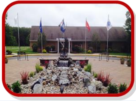
Millsboro Veterans Memorial Cemetery 26669 Patriots Way Millsboro, Delaware 19966 Phone: (302) 934-5653