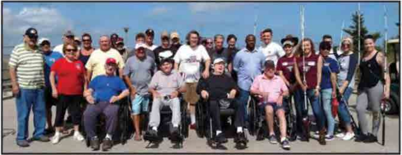
The American Legion Post 17 Fall Fishing Trip attendees.